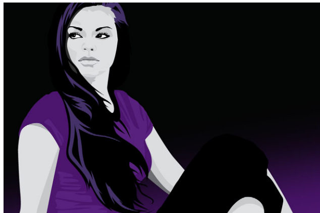
B Sitting Girl [Personal illustration project]